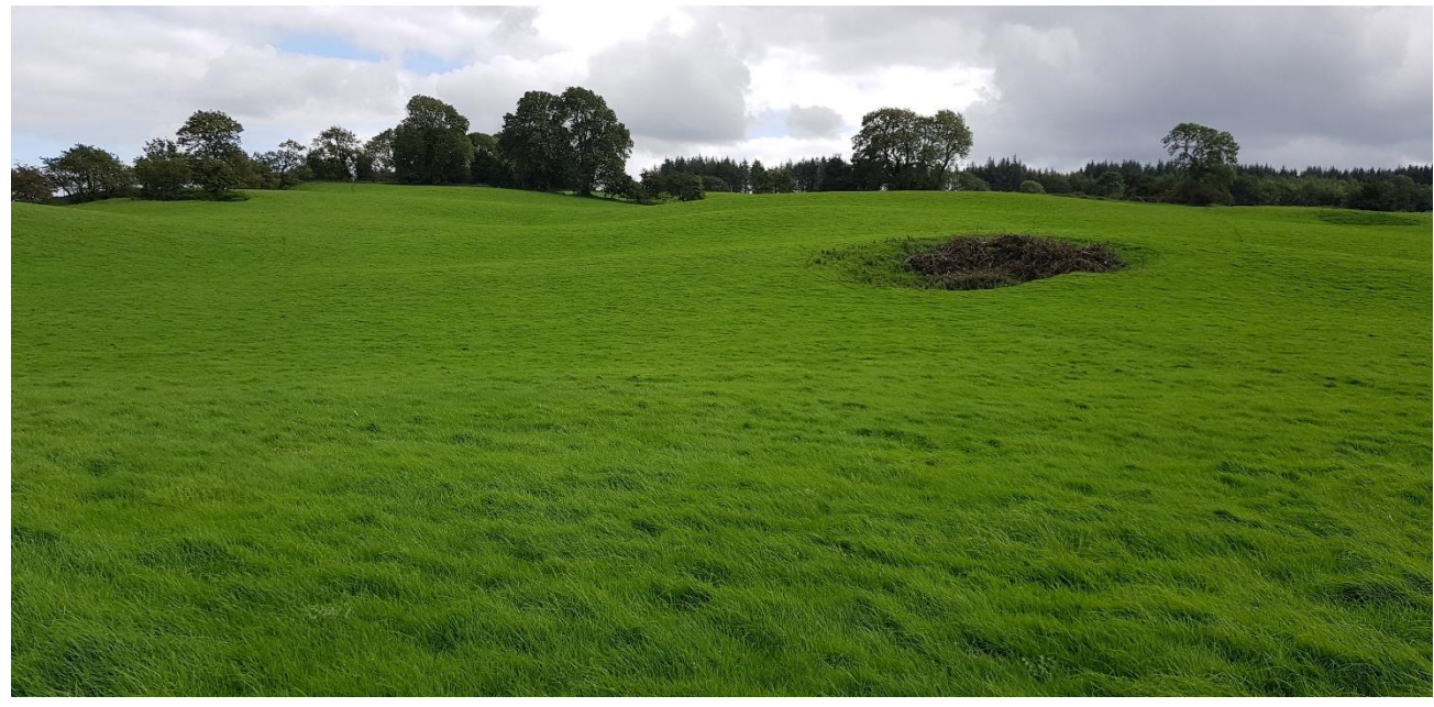
Plate 10.6: View of Area 6 looking southeast.

This is the southeast corner of a large rectangular northwest sloping field of pasture enclosed by banks and ditches with mature trees (Plate 10.6). There are two historical disused quarry pits in the field identifiable on the OSI 25 Inch 1888-1913 mapping. There was no visible indication of any archaeological, architectural or cultural heritage material at ground level.