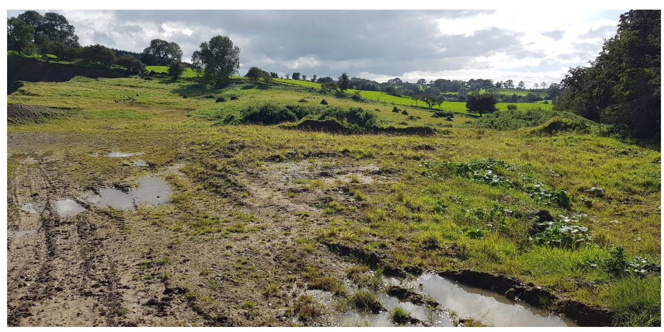
Plate 10.5: View of Area 5 looking west.

This is a wedge-shaped area that has been stripped of topsoil (Plate 10.5). There was no visible indication of any archaeological, architectural or cultural heritage material at ground level.