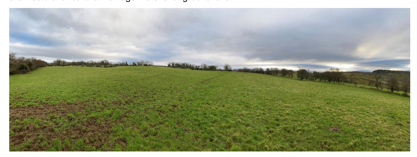
Plate 10.10: Panoramic view of Area 9 looking northeast.

This is a pentagonal-shaped area of undulating west-sloping pasture, enclosed by banks with hedgerow and mature trees (Plate 10.10). There was no visible indication of any archaeological, architectural or cultural heritage material at ground level.