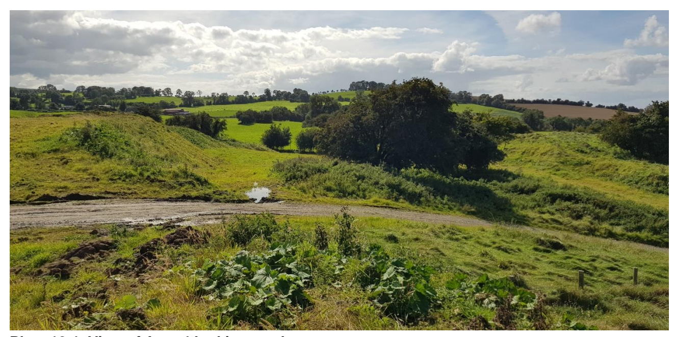
Plate 10.4: View of Area 4 looking northwest.

This is a four-sided northwest sloping area with internal haul road used to store soil, which is now grassed over (Plate 10.4). There is an agricultural shed on its north edge. There was no visible indication of any archaeological, architectural or cultural heritage material at ground level.