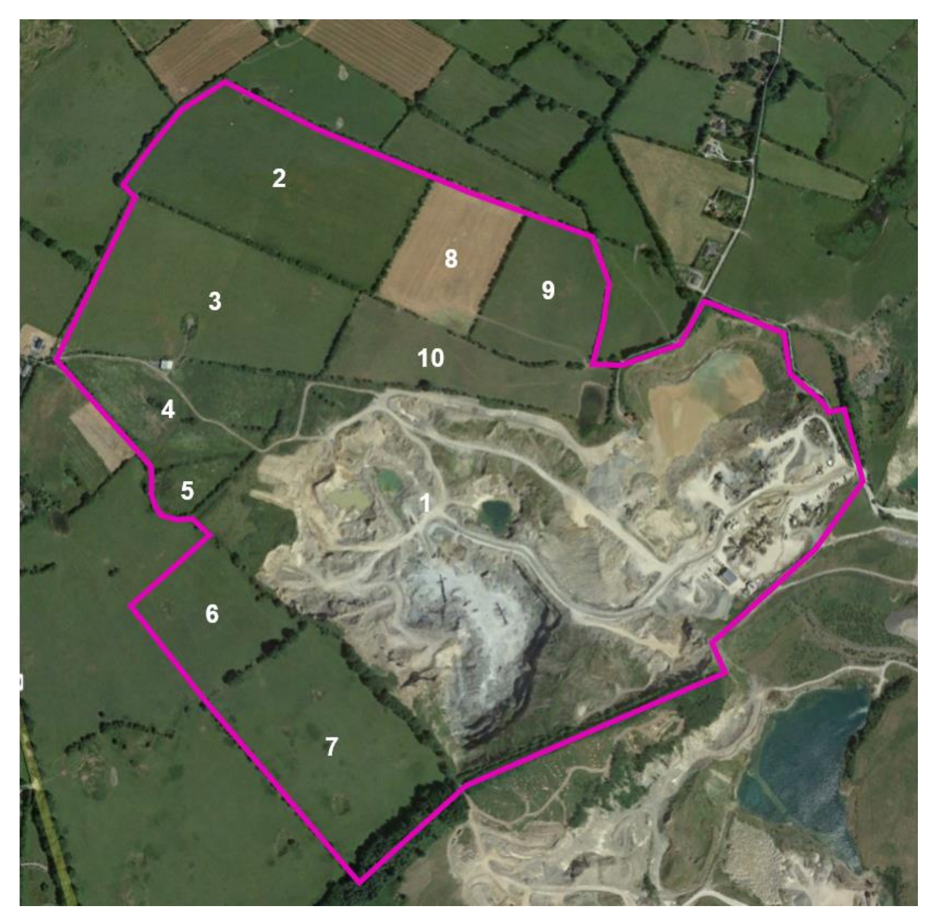
Plate 10.1: June 2018 aerial image of the application are outlined in red from Google Earth with the fieldwork areas numbered.

This is the existing area of extraction. All topsoil and subsoil has been removed and there is no surviving archaeological, architectural or cultural heritage material (see Plate 12.1).