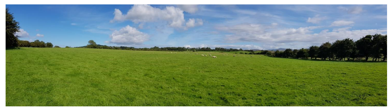
Plate 10.2: Panoramic view of Area 2 looking east.

This is a large trapezoidal-shaped southwest sloping field of pasture enclosed by banks and ditches with mature trees (Plate 10.3). There is one historical disused quarry pit in the field identifiable on the OSI 25 Inch 1888-1913 mapping. There was no visible indication of any archaeological, architectural or cultural heritage material at ground level.