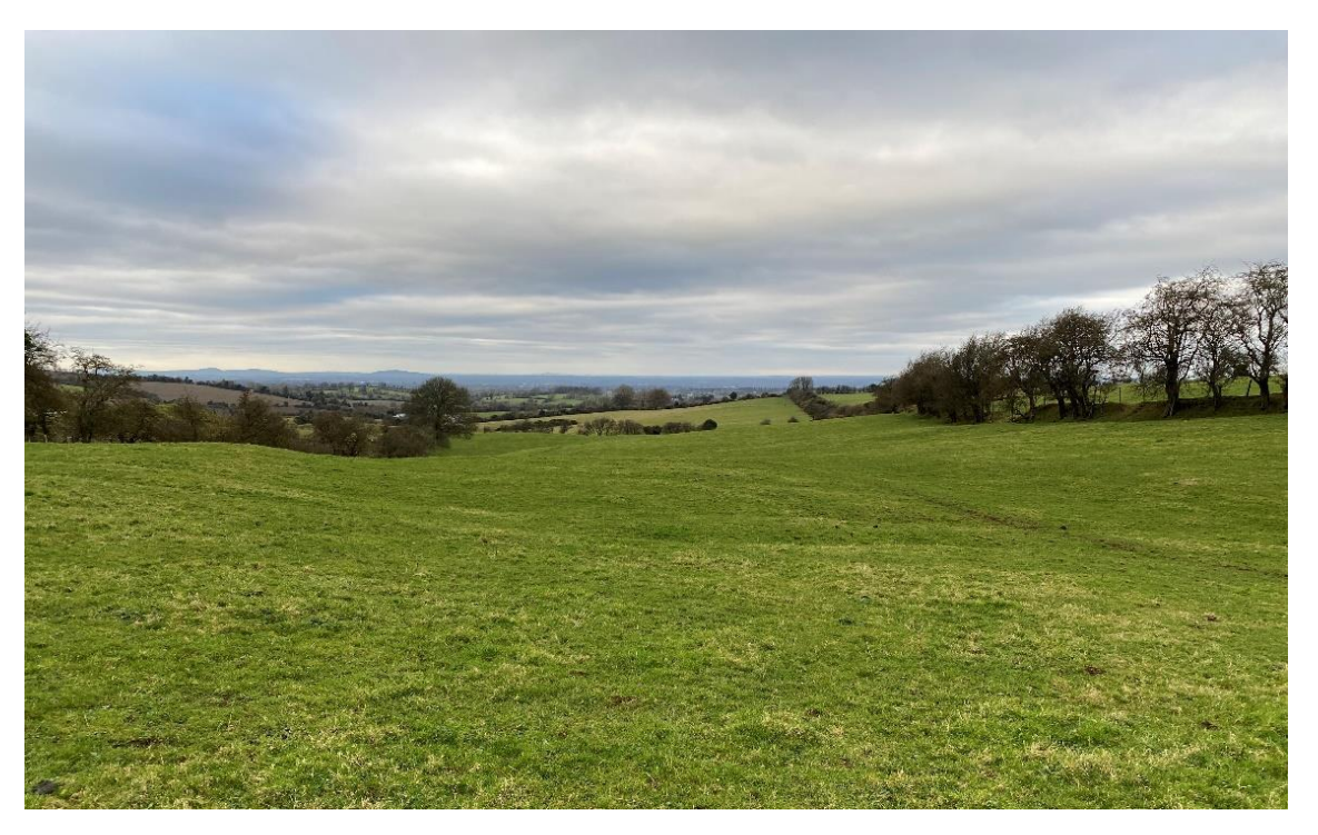
Plate 10.11: View of Area 10 looking northwest.