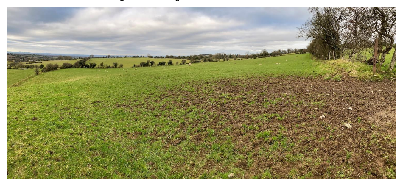
Plate 10.9: Panoramic view of Area 8 looking northwest

This is a rectangular-shaped area of undulating west-sloping pasture, enclosed by banks with hedgerow and mature trees (Plate 10.9). There was no visible indication of any archaeological, architectural or cultural heritage material at ground level.