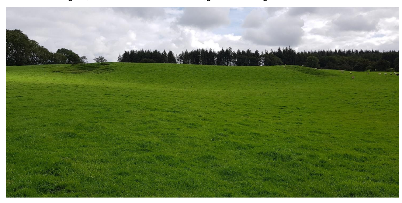
Plate 10.7: View of Area 7 looking southeast.

This is a large rectangular northwest sloping field of pasture enclosed by banks and ditches with mature trees (Plate 10.7). There are eight historical disused quarry pits in the field identifiable on the OSI 25 Inch 1888-1913 mapping. The Deerpark wall forms the southeast boundary (Plate 10.8). The wall is partly ruined with mature trees growing on it in places. There was no visible indication of any other archaeological, architectural or cultural heritage material at ground level.