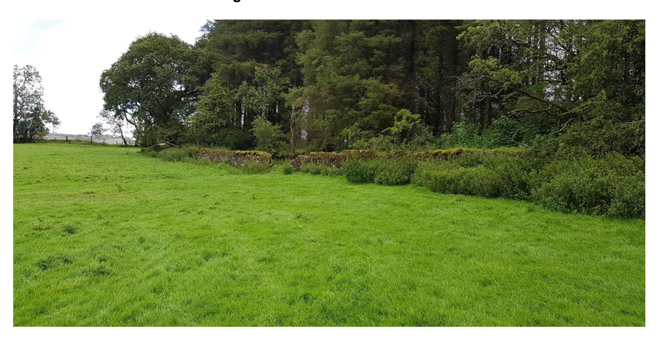
Plate 10.8: View of the Deerpark wall in Area 7 looking southeast